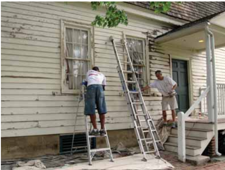
Workers start the much needed repairs at the Hays House.

September 26, 2010 marked the 125 th Anniversary of the founding of the Historical Society of Harford County. This milestone event in the history of the Society was celebrated with an extremely successful and enjoyable 125 th Anniversary Dinner in conjunction with the Annual Meeting in September and a commemoration ceremony at the Courthouse in Bel Air which was attended by over twenty descendants of the original founders of the Society in 1885.