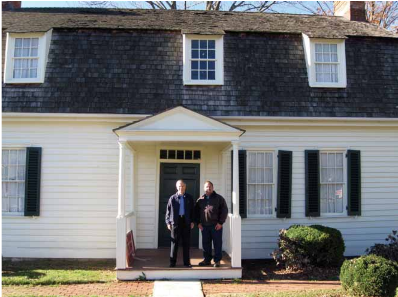
The Hays House after renovations

2010 ANNUAL REPORT - Copies of this report are available upon request at the Historical Society and on the web at www.harfordhistory.org