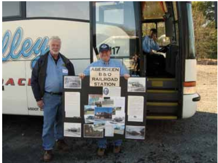
Members of the B & O Railroad Historical Society made a trip to the Aberdeen Station one of the excursions of their national convention which was held in Baltimore.

The Historical Society continued its commitment to the acquisition, restoration and preservation of the Aberdeen B&O Railroad Station. After significant delays in working through zoning issues with the Town of Aberdeen, the Purchase Sales Agreement with CSX for the station building and the adjacent land parcel to which the building will be moved was fully executed and the Deed recorded. The Society continues to negotiate with CSX regarding an additional donation land so that the building can be placed outside the flood plain area and to allow for more parking. It is expected that the station building will be moved during 2011.